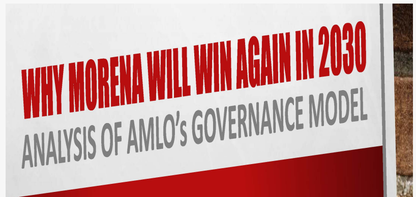
Title of MEI Report 984