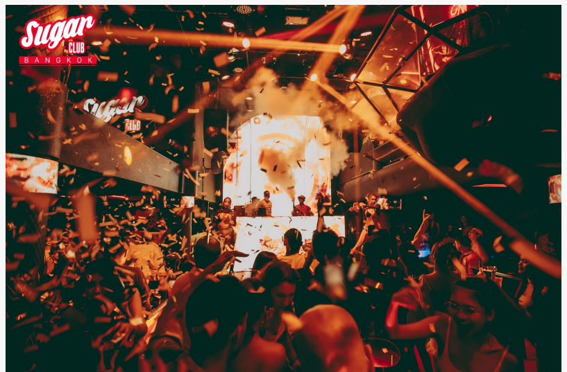
Sugar Club to celebrate nearly a decade as Bangkok's No.1 Hip Hop club

Guests are encouraged to don their best beach attire and prepare to dance the night away. Doors open at 9pm, and the club is eager to welcome everyone to this epic anniversary celebration.