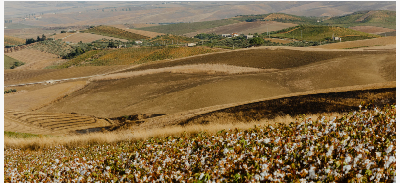
OVS Italian Cotton Fields