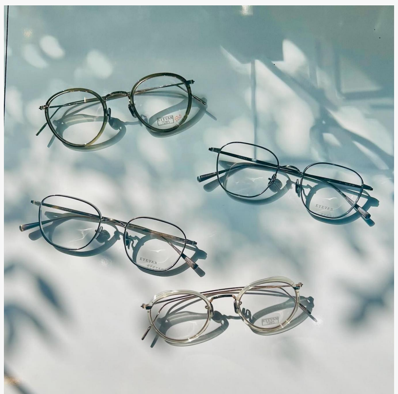
Oculus Eyecare carries a collection of luxury eyewear from independent designers such as Eyevan 7285.