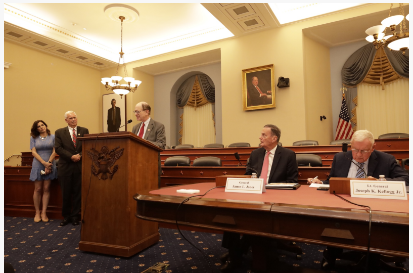
Bipartisan House Briefing Calls for US to Support Iranian Resistance