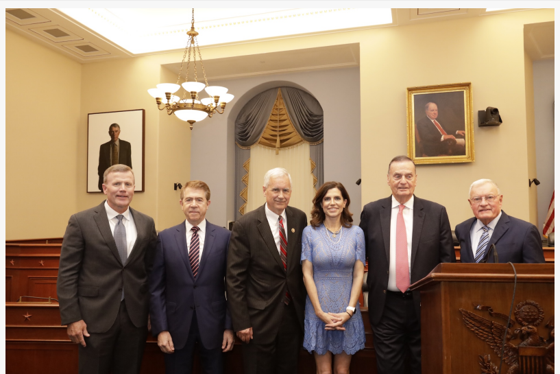
House Iran Briefing, September 10, 2024

WASHINGTON, DC, UNITED STATES, September 16, 2024 / EINPresswire.com/ -- On September 10, 2024, a bipartisan congressional briefing titled "IRAN: Confronting the Threat and Securing a Solution" was held in the U.S. House of Representatives. The event, which brought together prominent members of Congress, military leaders, and national security experts, emphasized