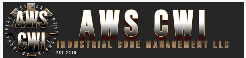
AWSCWI.COM's Precision at Work