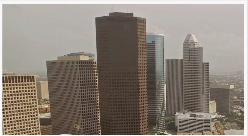
Downtown Houston Texas USA