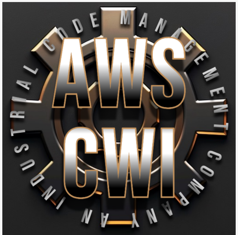
AWSCWI.COM Website Logo

AWSCWI.COM's Houston CWI welding inspector team is comprised of highly trained professionals equipped to address the specific needs of project owners, general contractors, and