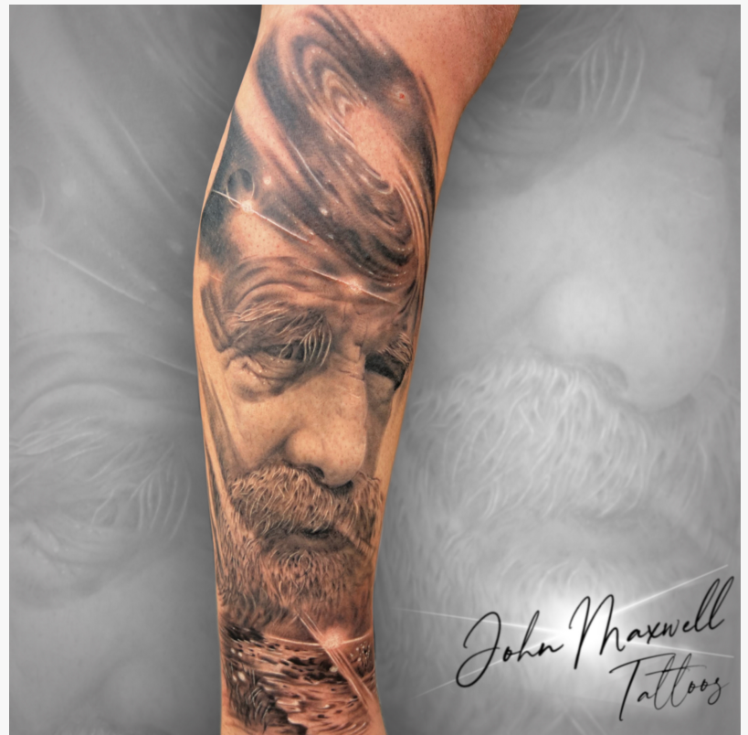
Wise Old Man