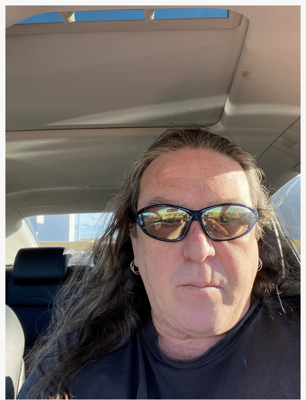
The Author Paul Blackburn

This press release can be viewed online at: https://www.einpresswire.com/article/742382133