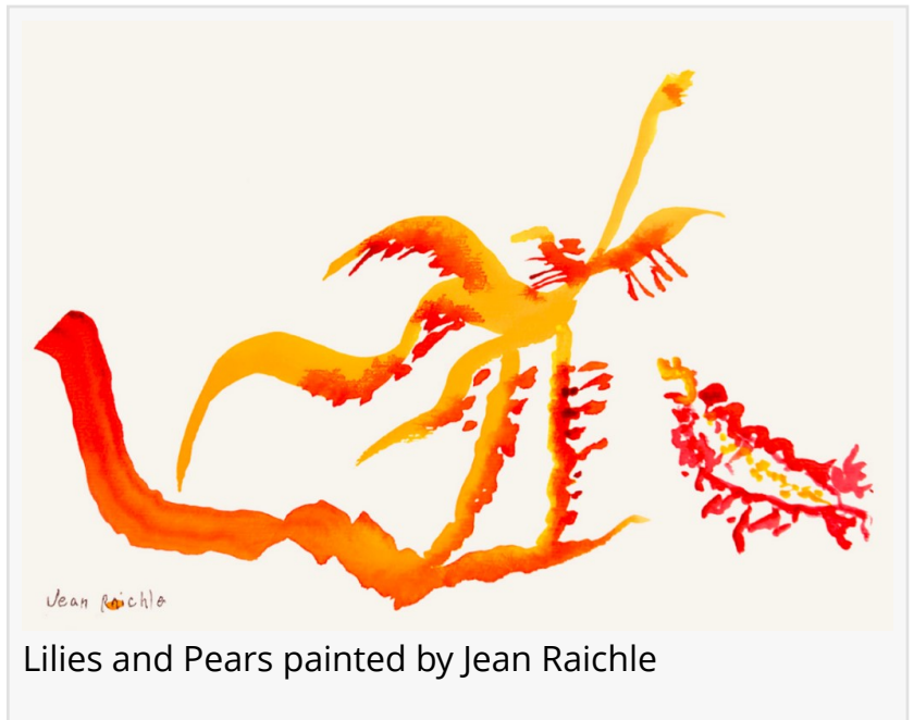
Lilies and Pears painted by Jean Raichle

This press release can be viewed online at: https://www.einpresswire.com/article/742361722