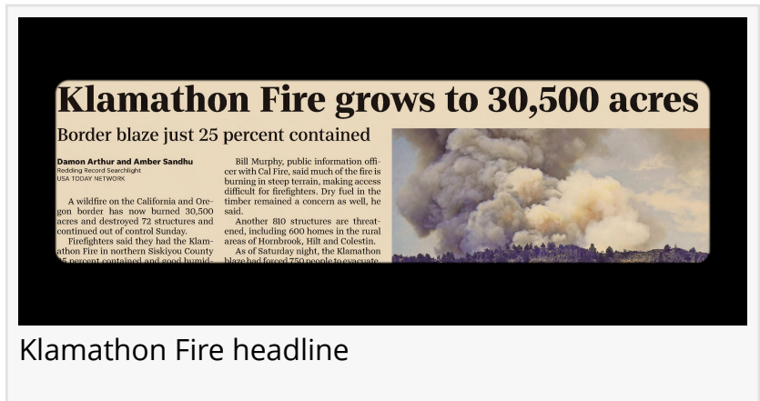
Klamathon Fire headline

This press release can be viewed online at: https://www.einpresswire.com/article/741594069