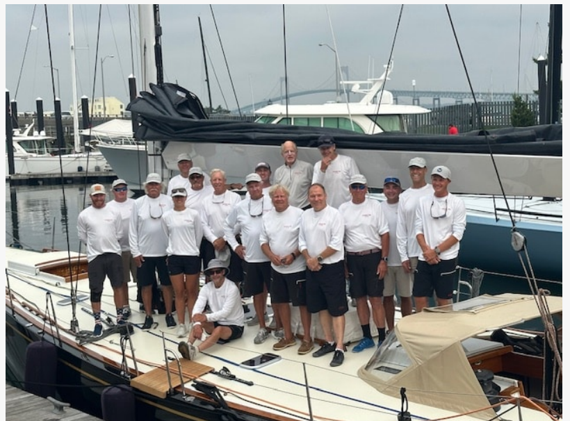
Running Tide Crew after the Ida Lewis Long Distance Race 2024