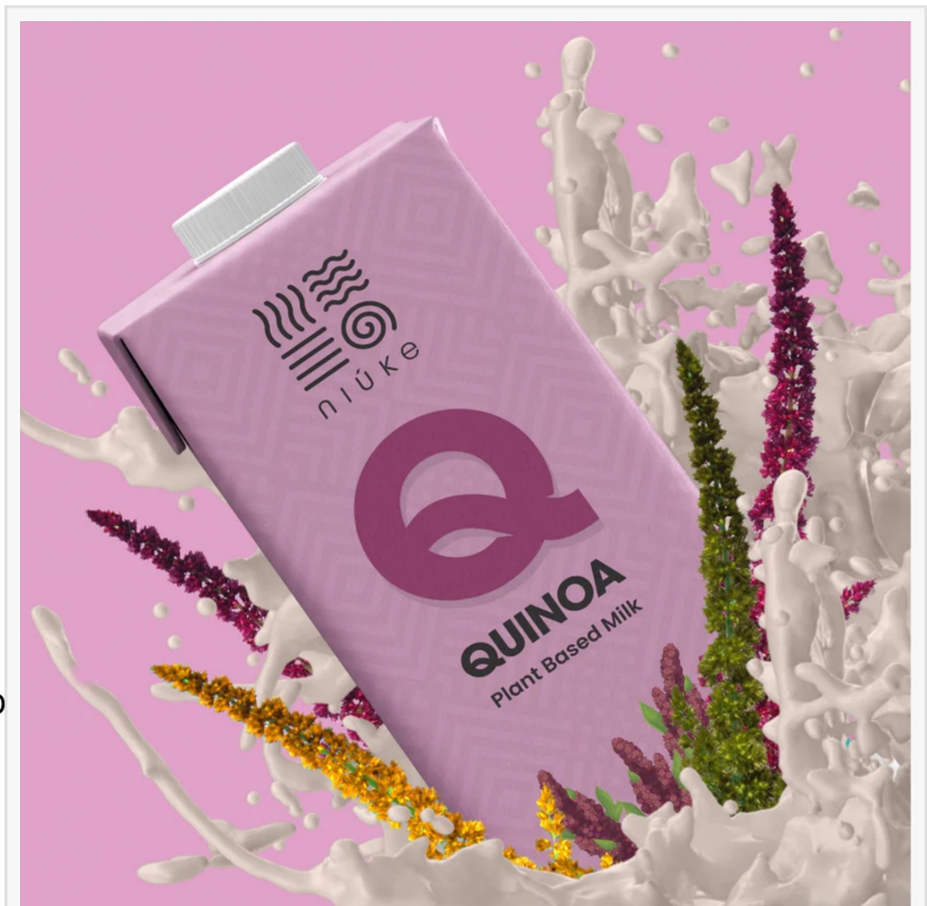
NIÚKE Foods Quinoa Plant Milk "QMILQ"