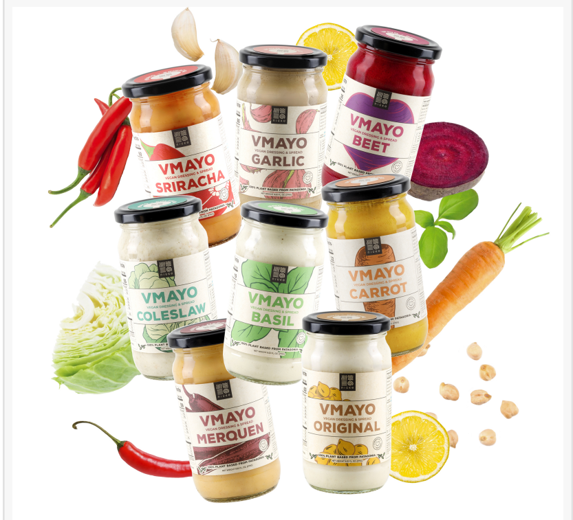
NIÚKE Foods V_MAYO Plant Based Condiments