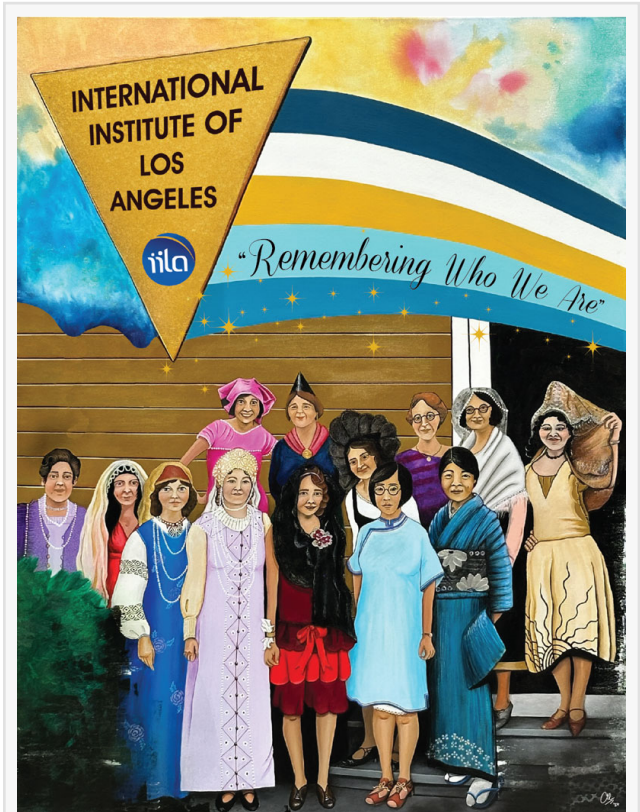
IILA Celebrates 110 Years Serving the Immigrant Community