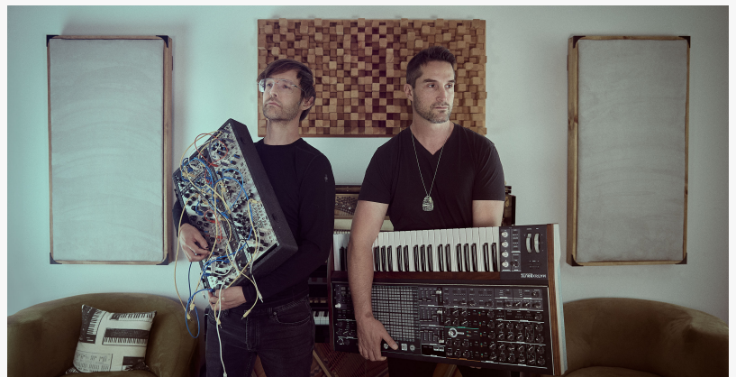
Idle Echoes' Jeff Dodson and Arkfoo have just released their debut alternative indie pop album, 'Velvet Phoenix.'