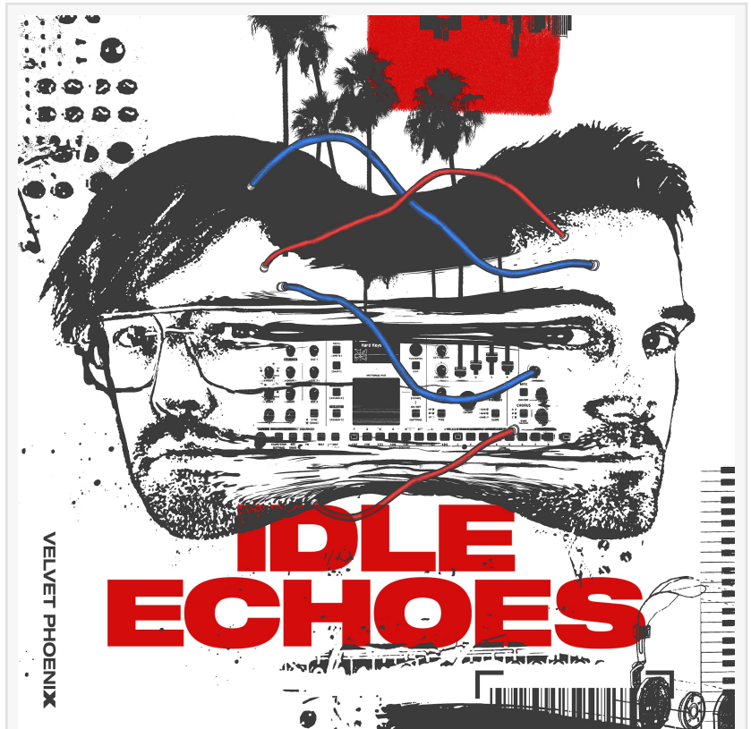
'Velvet Phoenix' is the debut album for Idle Echoes.

With 12 tracks ranging from ethereal and reflective to driving and pacing, "Velvet Phoenix" sits in an alternative indie-pop sweet-spot of powerful vocals backed by a mix of warm analogue synths, jangly guitars, punchy acoustic drums and lush FX for atmosphere and depth. Frontman Arkfoo has a falsetto that can drift skyward, reminiscent of Thom Yorke at times, but also grounded in an earnest soulfulness at other times.