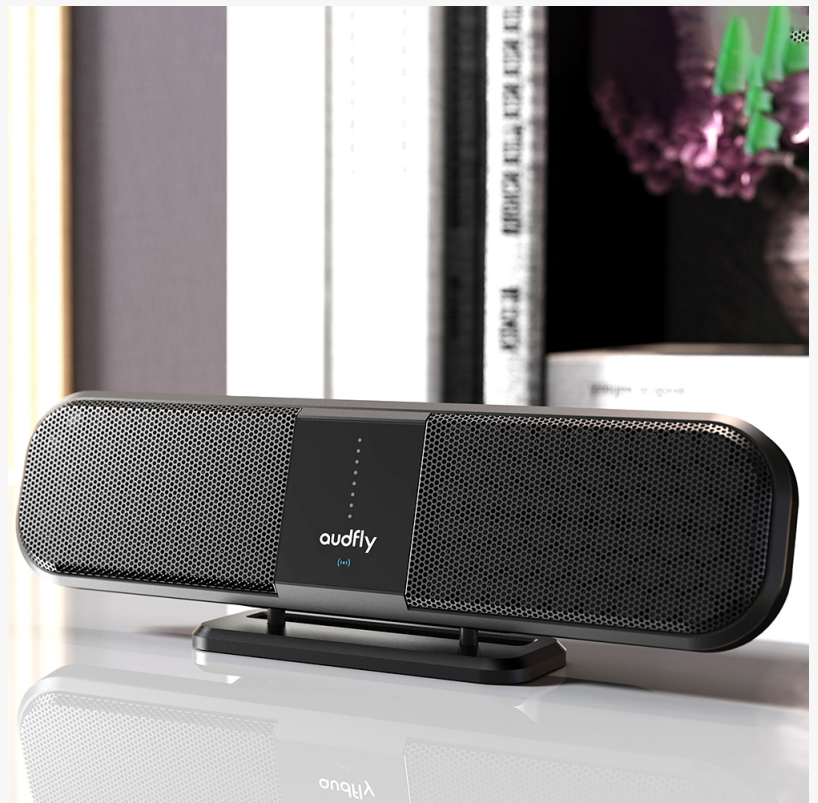
Model X2 Directional Speaker