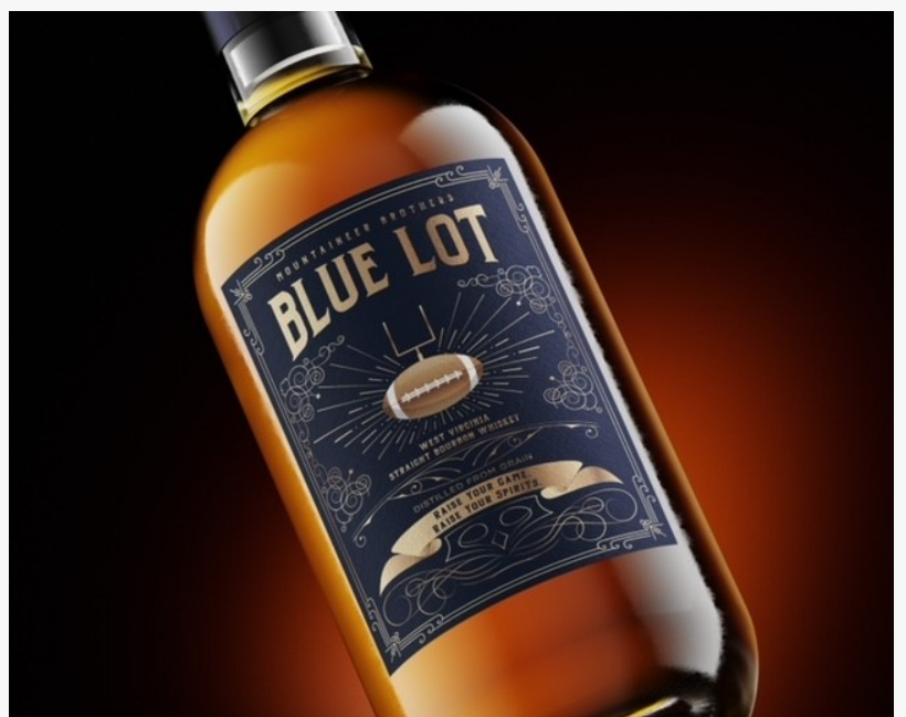
Beautiful Blue Lot Bourbon Bottle

Distilled and bottled entirely in partnership with Devil's Due Distillery in West Virginia, this bourbon truly celebrates the state's enduring traditions and legacy. It's perfect for tailgating, sharing stories with friends, or savoring a quiet moment of reflection.