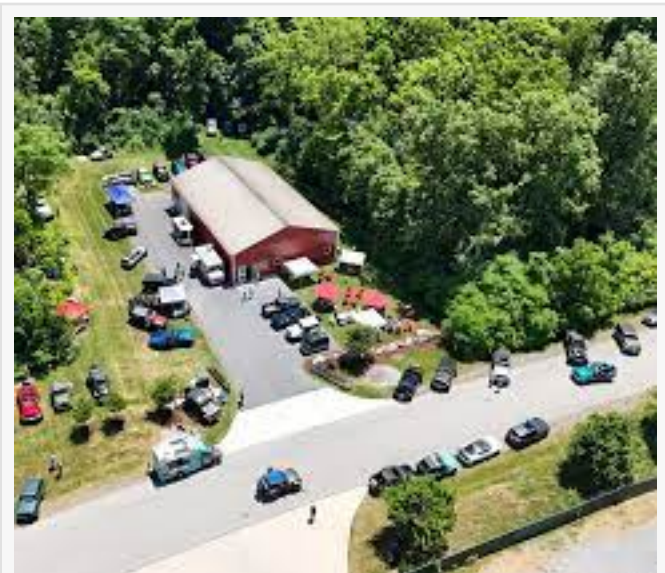
View of Devil's Due Distillery