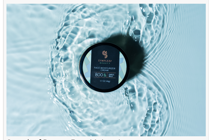
Sympleaf Beauty Face Moisturizer