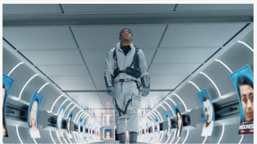
A still from the video "We are the Descendants (in 79 Languages)" featuring Fredo Bang.

LOS ANGELES, CA, USA, August 14, 2024 /EINPresswire.com/ -- Brahasong Records/Chezworks announce the release of the musical video for Steven Chesne's new release, 'We are the Descendants (in 79 Languages) (feat. Fredo Bang)'.