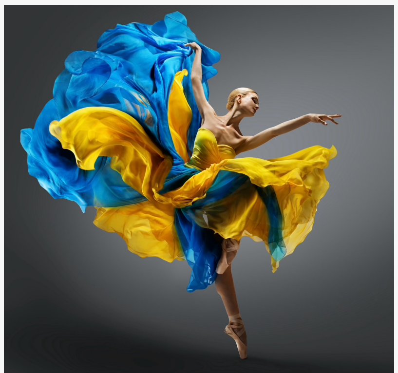
National Ballet of Ukraine Dancer

44 dancers from the two companies will perform before a state-of-the-art, massive 3-D screen, immersing the audience in spectacular scenic elements enhancing the companies' world class performances. The tour marks the first time any dance company has performed with this groundbreaking technology.