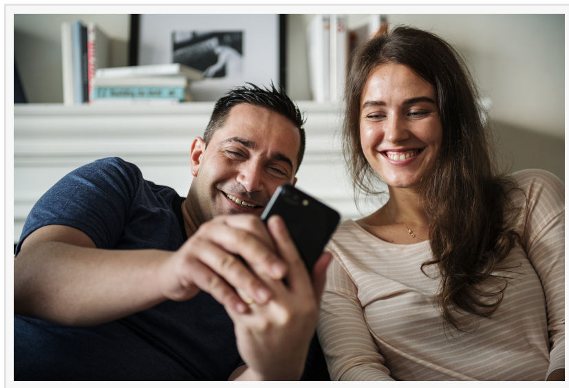
Learning relationship skills at home.

Relationship education has been shown to improve communication, reduce conflict, and increase overall relationship satisfaction. Yodi leverages this research, providing users with practical tools and strategies that can make a real difference in their everyday lives.