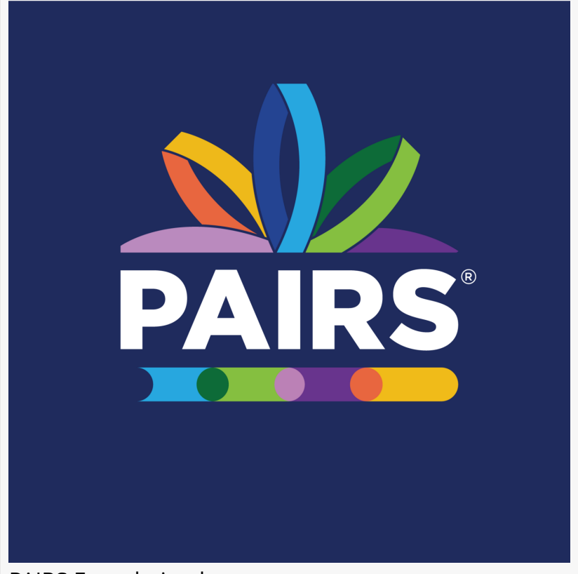
PAIRS Foundation logo