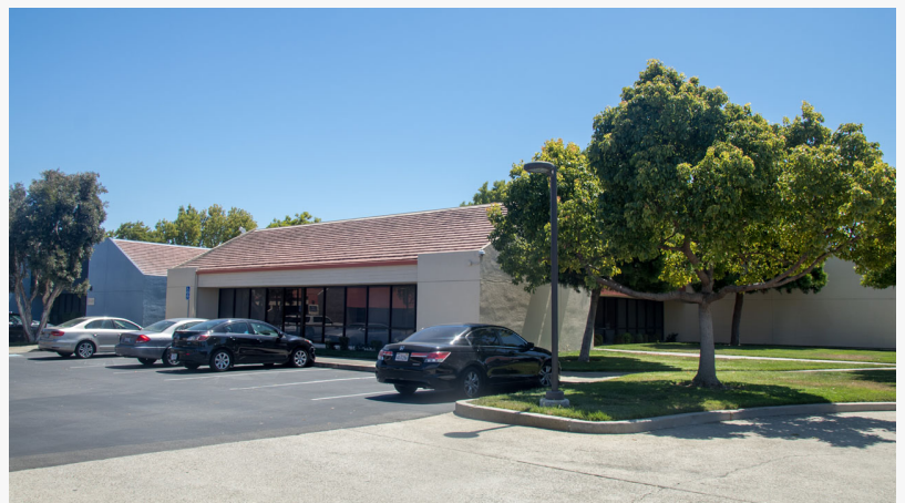
Patent PC Office