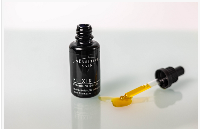
ELIXIR: retinol alternative premium serum