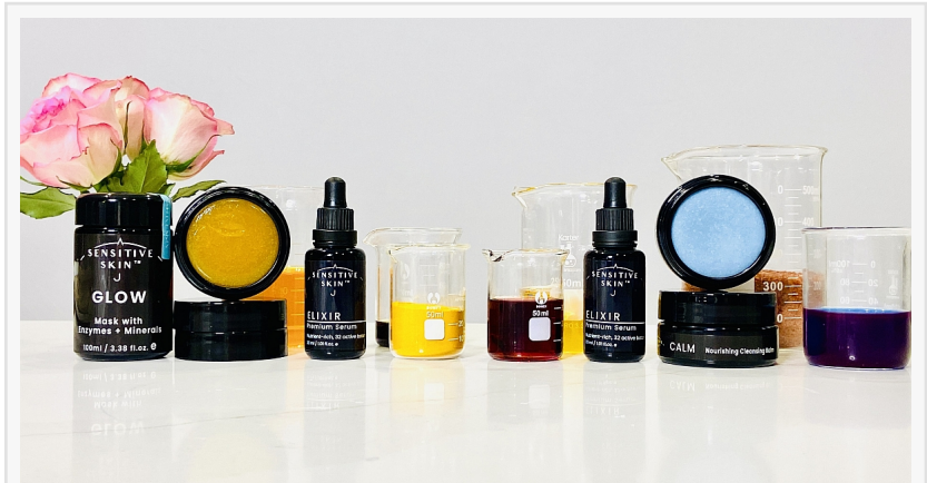
SENSITIVE SKIN LLC's products

The EU's recent decision to limit retinol concentrations in over-the-counter skincare products has sent ripples through the beauty industry. Retinol, long considered a gold standard in anti-aging