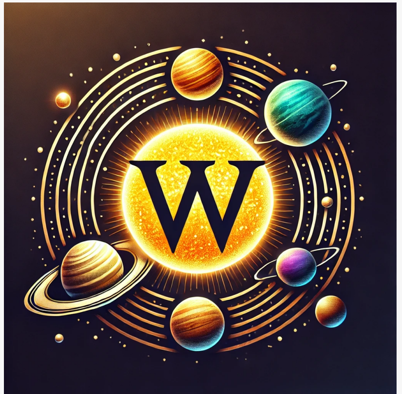
Artificial Intelligence In Color