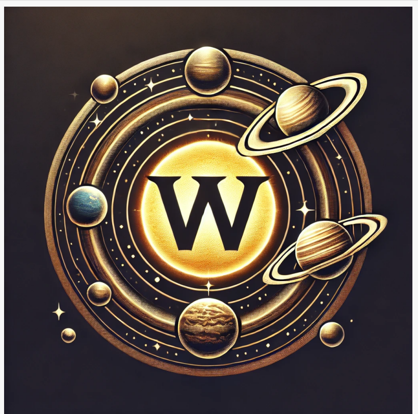
The Financial Worlds

Waterloomeconomics Inc. is not just adapting to the changes brought about by AI; it is actively shaping the future by providing valuable resources and guidance to those affected by the evolving job market. By bridging the gap between AI technology and real-world application, the company is transforming challenges into opportunities for entrepreneurs and small businesses across Michigan and beyond.