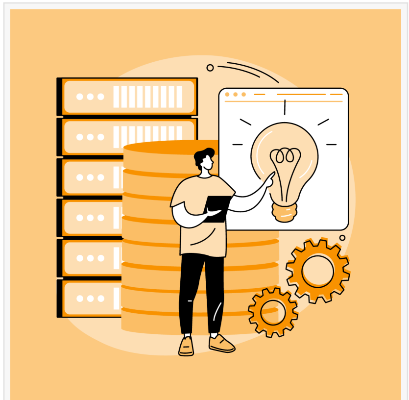
Comparing DITA Maps using REST API, expanding beyond traditional Java-based comparisons