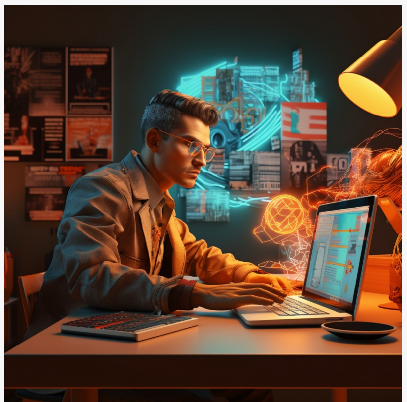
Lounge Lizard Enhances Digital Interactions with Expertise in User Experience (U/X)