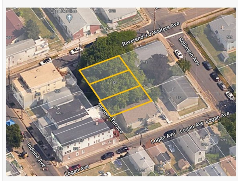
Morgan Terrace - 3 Lots