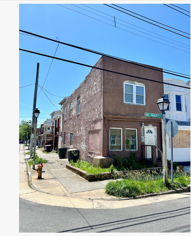
2000 McKinley Ave