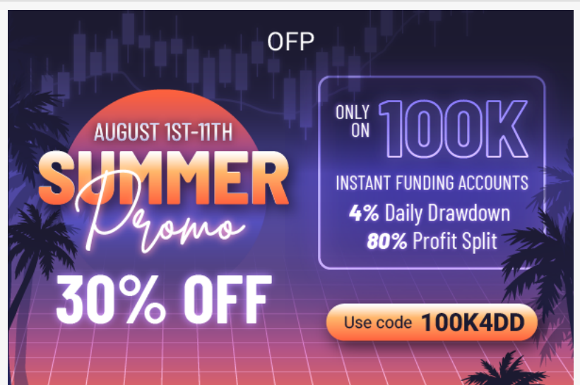
OFP 30% OFF August Summer Promotion

OFP Funding stands out as the only instant funding prop firm that offers custom accounts, allowing traders to choose their daily drawdown, profit split, type of payout (Monthly, Biweekly, On-Demand), and type of currency. This unique feature gives traders full control over their