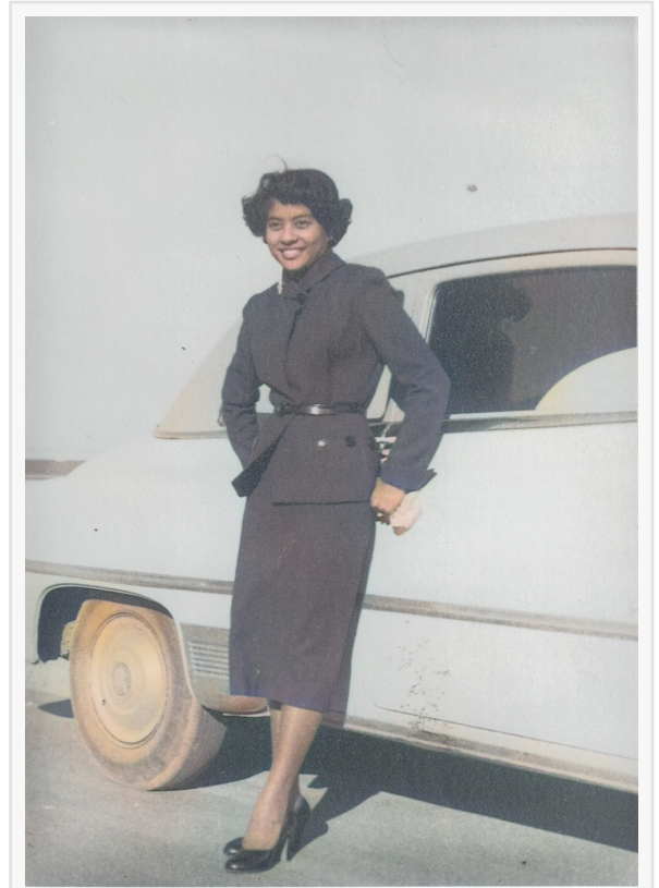
A portrait of New Orleans' black Creoles and the '60s strivers they spawned

This press release can be viewed online at: https://www.einpresswire.com/article/731698244