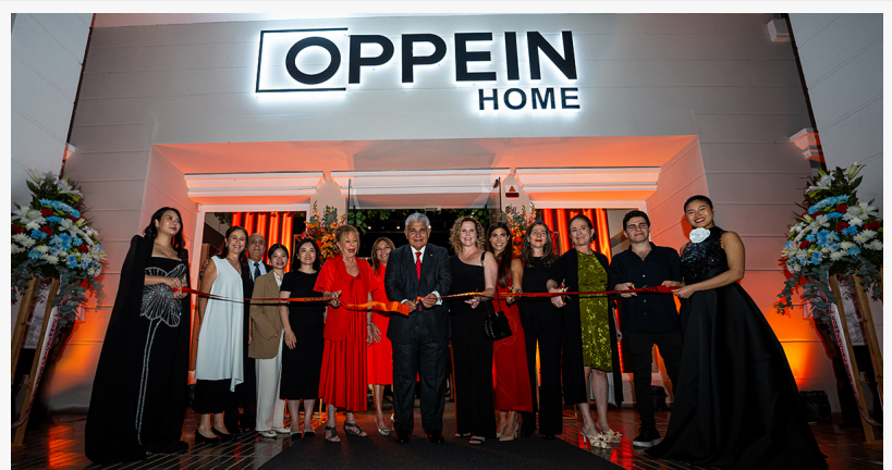
Panama president graces Oppein cabinet showroom opening

As a thriving furniture market, Panama presents a booming demand for eco-friendly, high-quality furniture, reflecting the country's growing awareness of environmental sustainability. Recognizing this unique opportunity, Oppein Home, renowned for its custom cabinetry and furniture, is eager to make a significant impact in this dynamic market. With a deep commitment to innovation and excellence, Oppein treasures the chance to bring its superior products to Panamanian customers. The company aims to meet and exceed the expectations of a market that values both quality and environmental responsibility. Oppein's entrance into Panama marks