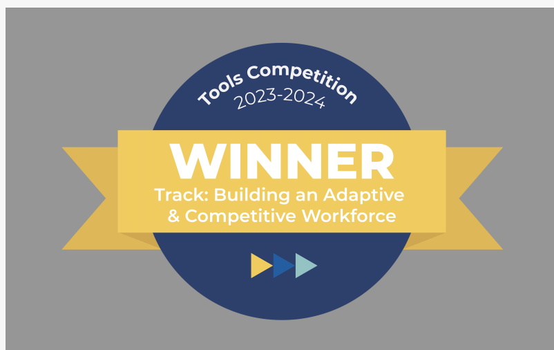
DARPA Tools Competition Winner