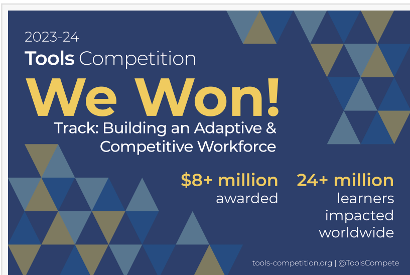
DARPA Tools Competition

The 2023-24 Tools Competition was run with support from: Renaissance Philanthropy, Griffin Catalyst, Walton Family Foundation, Bill & Melinda Gates Foundation, Siegel Family Endowment,