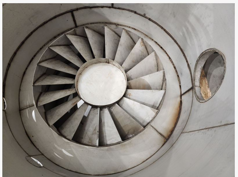
In progress the scrubber eventually takes shape