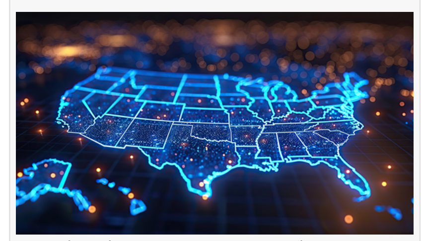
Expand EV Charging Options & Drive Clean Energy Forward

EV adoption in the U.S. has been stymied by the slow expansion of public charging infrastructure, which is still unreliable throughout the country. With current projections indicating a surge of EV ownership to over 48 million by 2030 (an increase from 3 million in 2023), up to 28 million public charging stations may be needed by 2030 (McKinsey 2024). There are currently only 183,000 public charging stations in the U.S., according to the U.S. Department of Energy.