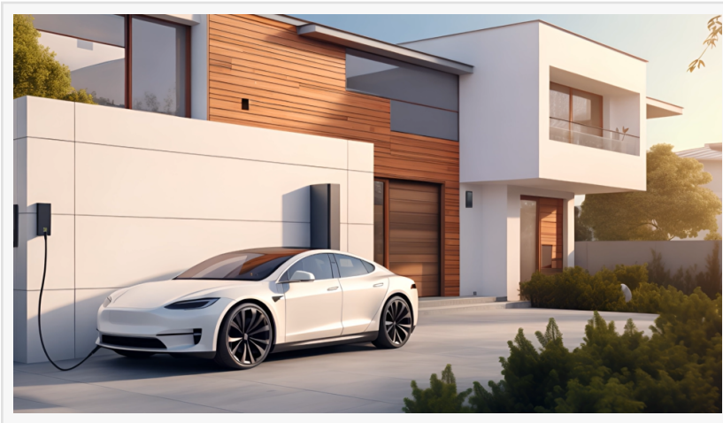
Neighbor to Neighbor EV Charging Network

JuiceNet's EV charger hosts deliver a community-driven alternative to the country's current EV charging infrastructure, designed to help alleviate range anxiety and accelerate EV adoption. JuiceNet operates on a pay-per-use basis or a subscription fee, offering members a reliable and costeffective alternative to public charging stations. Guests can schedule charging appointments via the JuiceNet mobile app, designed to facilitate efficient charging experiences through smart transaction management, an interactive map, online scheduling, and host reviews. JuiceNet is now registering hosts and subscribers at: https://juicenet.ai.