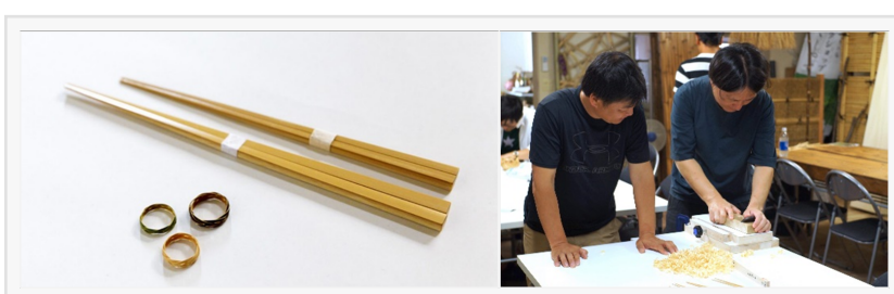
Chopstick crafting with Awaji Island bamboo

AWAJI CITY, HYOGO PREFECTURE, JAPAN, July 29, 2024 / EINPresswire.com/ -- Luxury villa GRAND CHARIOT Hokutoshichisei 135°, located in Awaji Island, Hyogo Prefecture, will be gathering artisans of traditional Kyoto crafts to offer a traditional crafting experience, "Traditional Kyoto Craft Experience Plan on Awaji Island, the Birthplace of Japan" on Saturday, September 7th.