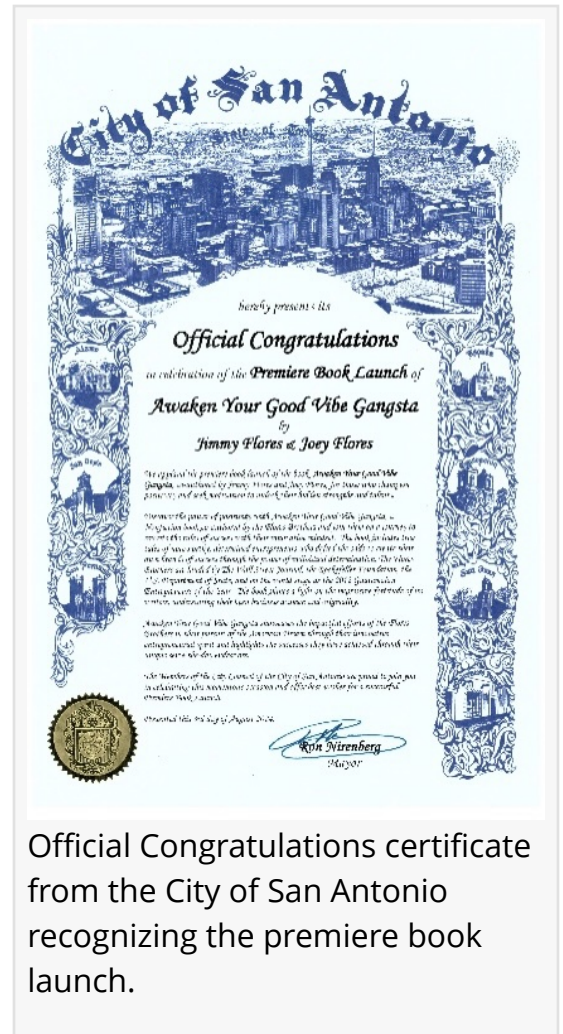
Official Congratulations certificate from the City of San Antonio recognizing the premiere book launch.

Staten House, based in New York, was chosen by GVG as the book’s publisher of choice due to