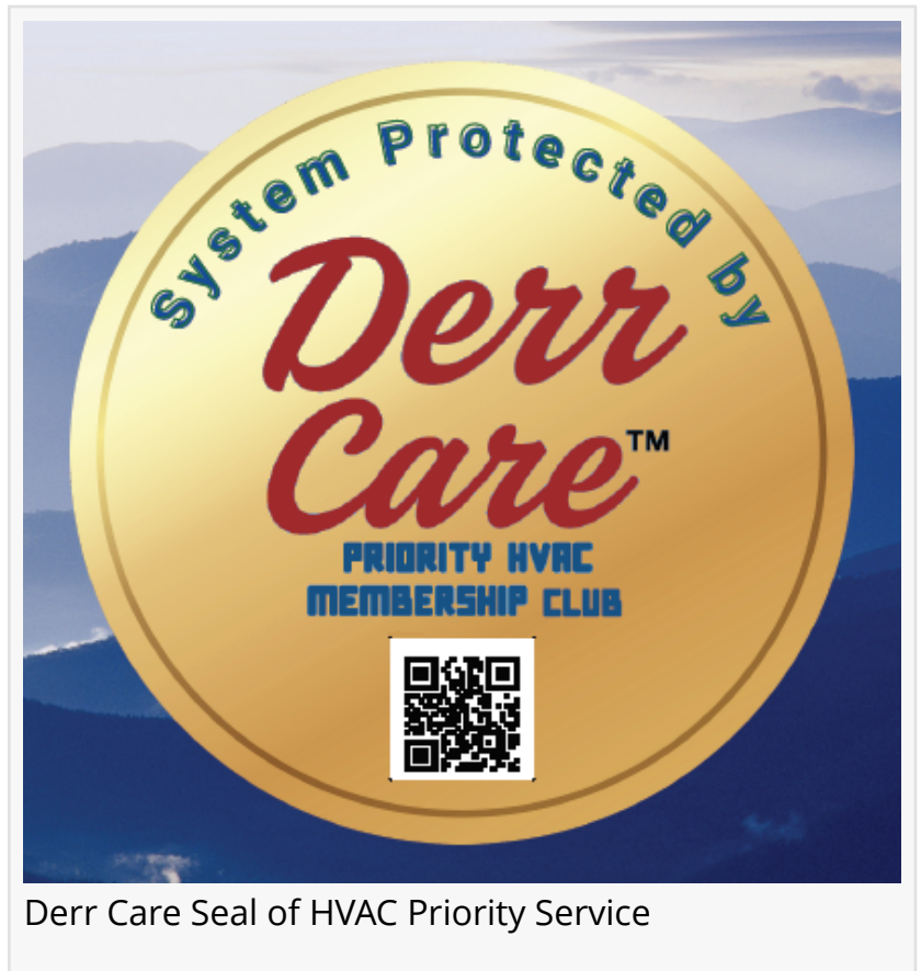
Derr Care Seal of HVAC Priority Service