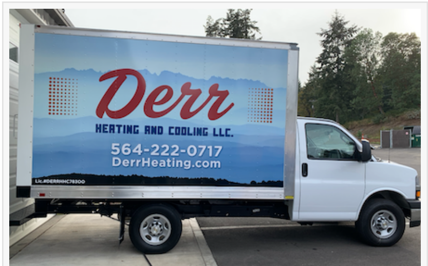
Derr Heating and Cooling goes mobile all over Kitsap County.