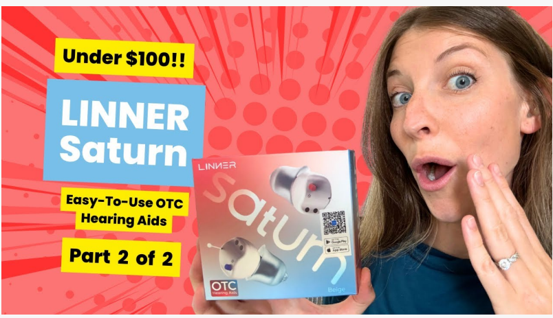
Definite Hearing Loss Saturn Review