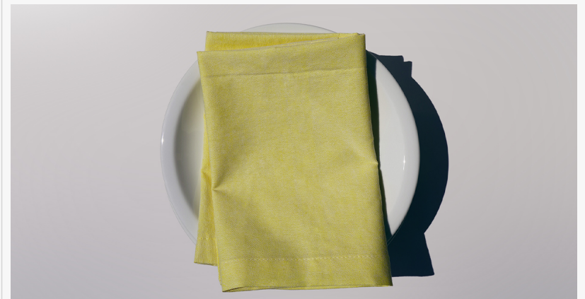
The West Oxford Napkin

Limited to 200 units, the quantity was chosen to balance responsible production with preventing excess inventory. This limit posed challenges: menswear manufacturers familiar with the fabric often declined small orders, and those willing to take on the project demanded higher minimum quantities. Additionally, the napkins' size and hem specifications required much of the manufacturing, particularly cutting, to be done by hand, leading to slight variations in each piece. The result is a napkin with the ideal weight, softest hand feel, greatest endurance, and versatility.