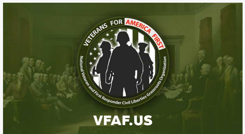
Veterans for America First official logo