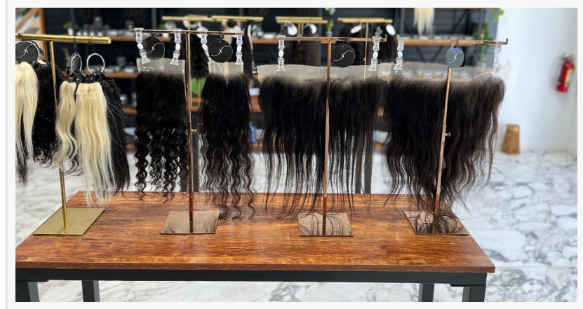
Private Label Showroom Atlanta

The Crochet Boho Braids come in three lengths - 16", 20", and 24" - catering to every style preference, from cute and cropped to long and luxurious. Each set comes in a versatile Natural Black 1B color and features 20 pre-twisted braids per ring, making installation a breeze whether you're a DIY enthusiast or a professional stylist.