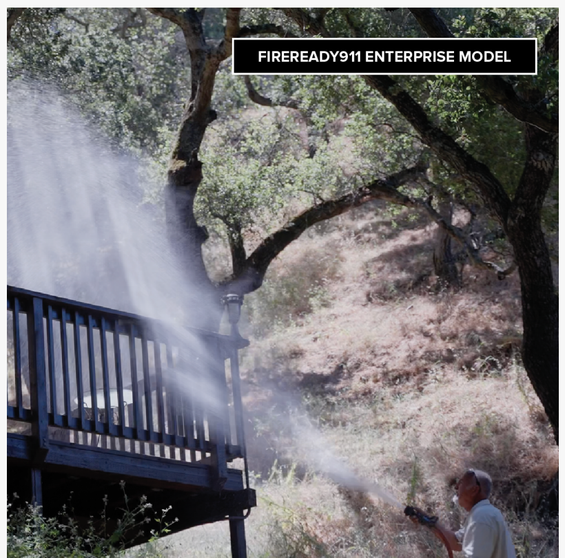
FireReady911 'Enterprise' for HOA's, ranches, wineries, infrastructure...