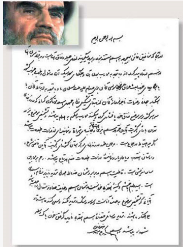
Javaid Rehman, "Khomeini's fatwa, The fatwas, and official pronouncements categorized members and sympathizers of the PMOI as(hypocrites) and (apostates), "waging war against God" that must be executed" justifying their extermination under religious pretexts.

Rehman stressed the need for an international investigative and accountability mechanism to address these crimes. "The continued concealment of the fate of thousands of political opponents and the whereabouts of their remains amounts to the crime against humanity of enforced disappearance," he stated.