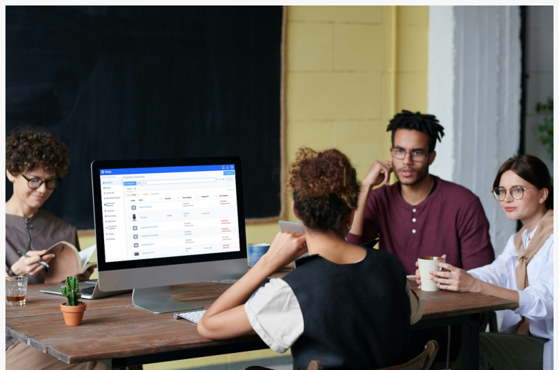
Espoir Autisme Corse Employees Using the Inventory Management App Timly on a Laptop and a Tablet

Most organizations face challenges with their asset management, and nonprofits are no exception. Without an adequate solution, daily operations are bogged down by inefficient processes, delays, and misplaced equipment.