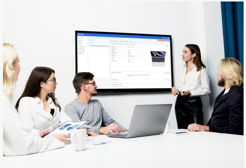
Timly asset management software in every office