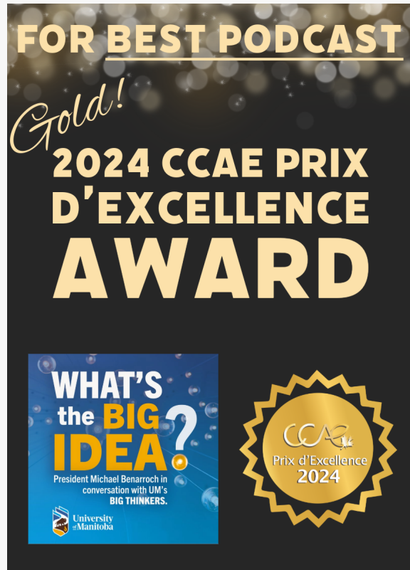
2024 Prix d'Excellence from the Canadian Council Advancement of Education (CCAЕ)

CASE is the global nonprofit association dedicated to educational advancement—alumni relations, communications, development, marketing, and advancement services—and championing education to transform lives and society. The Circle of Excellence Awards showcase outstanding work in advancement services, alumni relations,