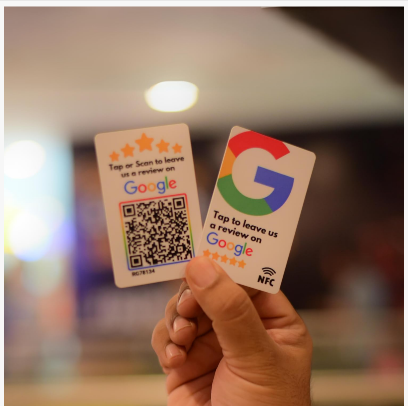
Google Review Card | Google Review QR code | Ad School | Google Rating 2

The Magical Google Review QR codes take the convenience a step further. These QR codes can be integrated into various marketing materials such as business cards, brochures, and receipts. Customers can scan the QR code with their smartphones, leading them directly to the review page. This seamless process not only enhances customer engagement but also fosters a culture of feedback and improvement.