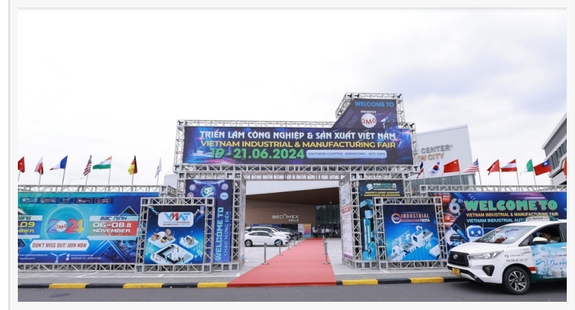
Vietnam Industrial & Manufacturing Fair 2024

This press release can be viewed online at: https://www.einpresswire.com/article/729713888