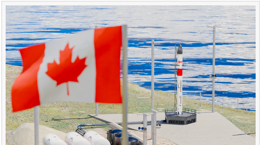
Spaceport Canada Render

Canadian spaceport, carrying a Canadian payload - that is the definition of sovereign launch, and it will change the shape of our great nation for generations. We are working day and night and investing significant resources because time is of the essence. We are building this end-to-end capability, not a piecemeal solution, for all Canadians."