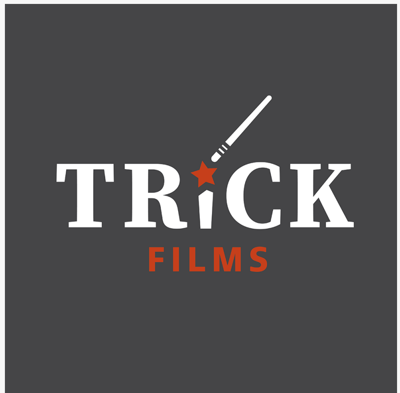
Trick Films Logo

Trucco is best known for his portrayal of 'Samuel T. Anders' on the critically acclaimed Sci-Fi series "BATTLESTAR GALACTICA" and appeared opposite Jessica Biel and Nicholas Cage in the film