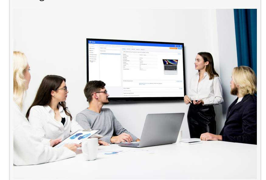
Timly asset management software in every office

other solutions that significantly streamline day-to-day operations.