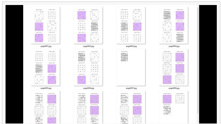
Wild Mixed Puzzle Book example