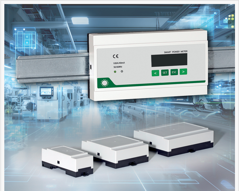
OKW's new RAILTEC B low-profile variant for individual electronics without multiple terminations

RAILTEC B is ideal for applications including Smart Factory/Industry 4.0, automation, building and safety technology, HVAC, measurement, communications, Smart Home and lighting control. It corresponds to regulations for machine building and the automotive industry.